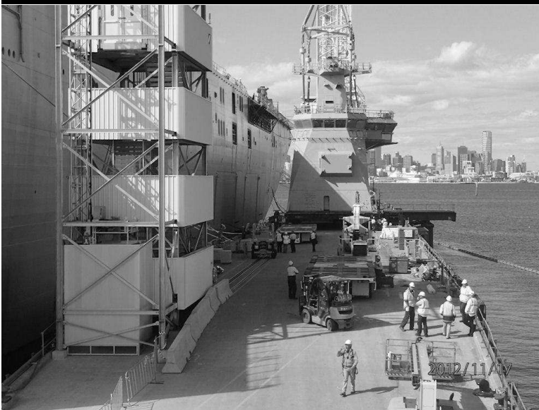
ABOVE Superstructure block ready to be lifted to the deck.

Now that the key elements of the vessel are in place, much of this year will be devoted to fitting Canberra out in preparation for her commissioning into the Australian fleet in the first quarter of next year following testing and sea trials.