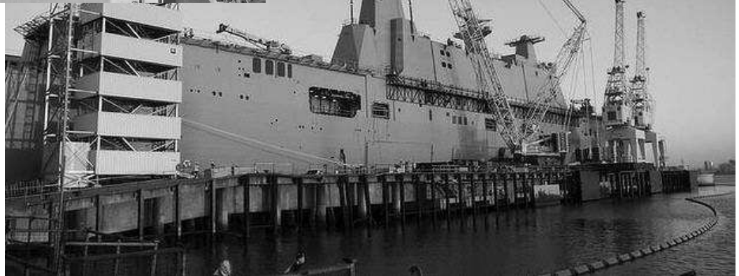
RIGHT Superstructure in place.